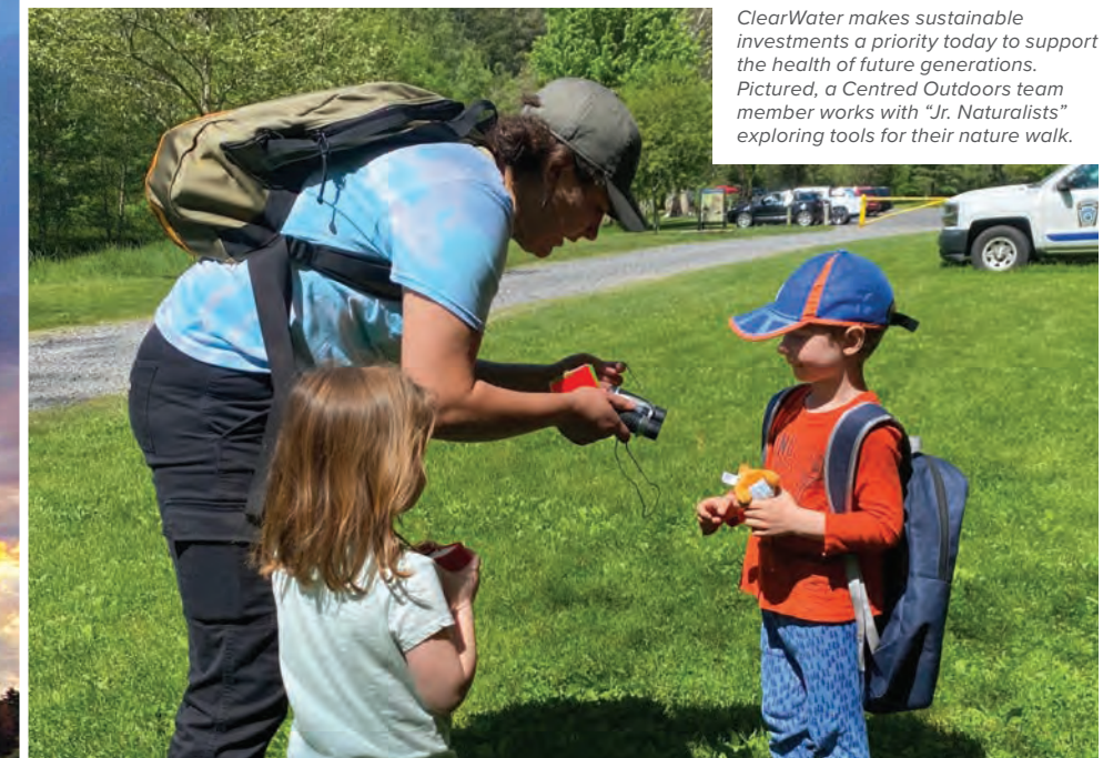
ClearWater makes sustainable investments a priority today to support the health of future generations. Pictured, a Centred Outdoors team member works with "Jr. Naturalists" exploring tools for their nature walk.