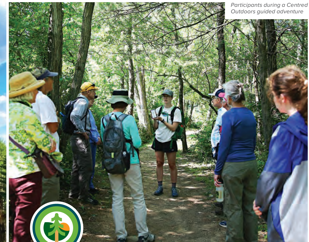
Participants during a Centred Outdoors guided adventure